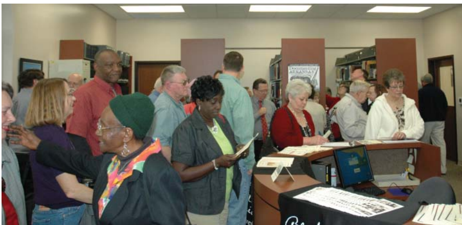
Visitors at the grand opening of the new NEARA facility

For additional information visit www.northeastarchives.org .