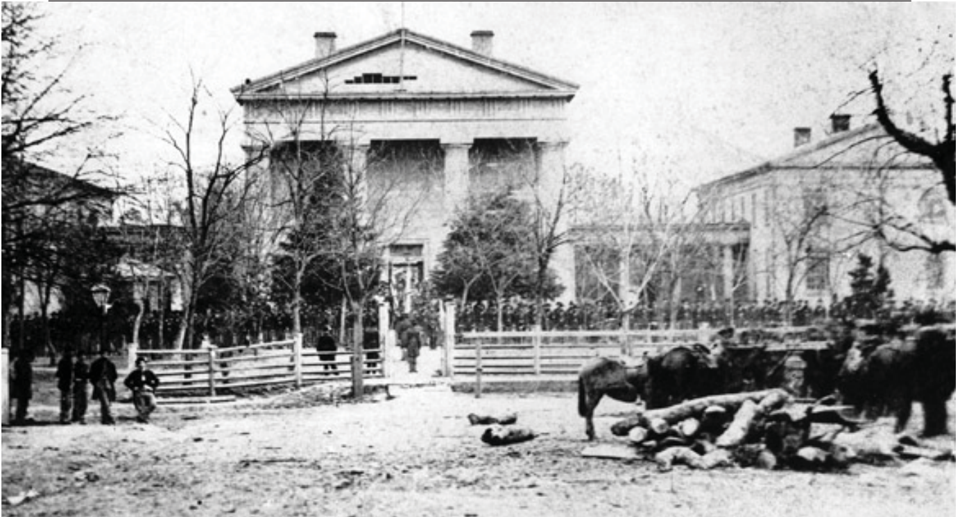
The Old State House during the Union occupation by the Third Minnesota Infantry in 1863–64. The building was home to the Confederate government until Union forces captured Little Rock in September 1863, leading the Confederate government to relocate to Washington in Hempstead County.