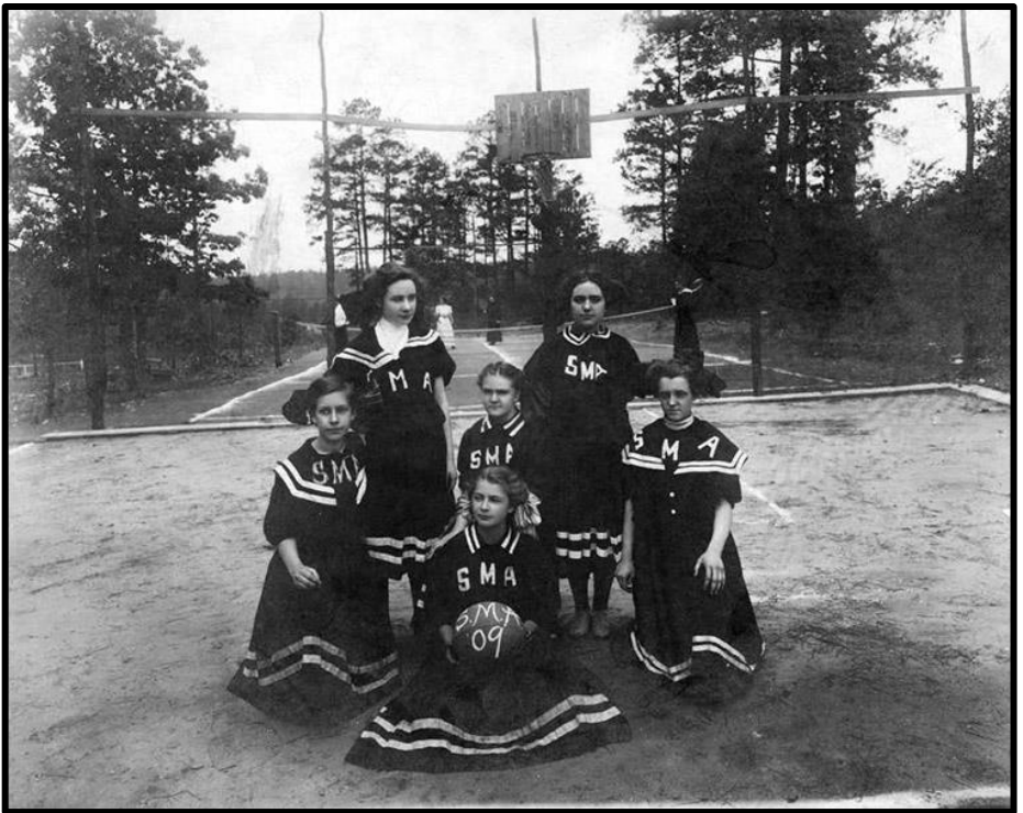
Mount St. Mary Academy basketball team, 1909.

The registration fee is $10. Deadline for registration is March 31 .