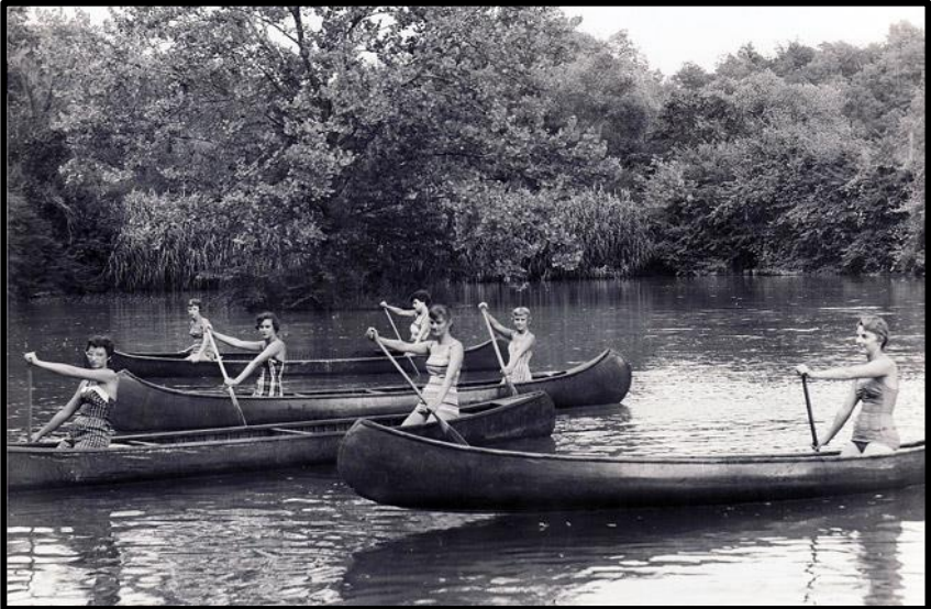
Campers canoeing at Camp Joyzelle, late 1950s.

Arkansas Game and Fish Commission (retired)