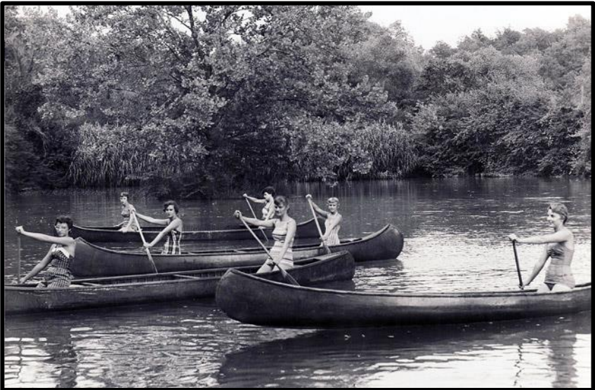
Campers canoeing at Camp Joyzelle, late 1950s.

Arkansas Game and Fish Commission (retired)