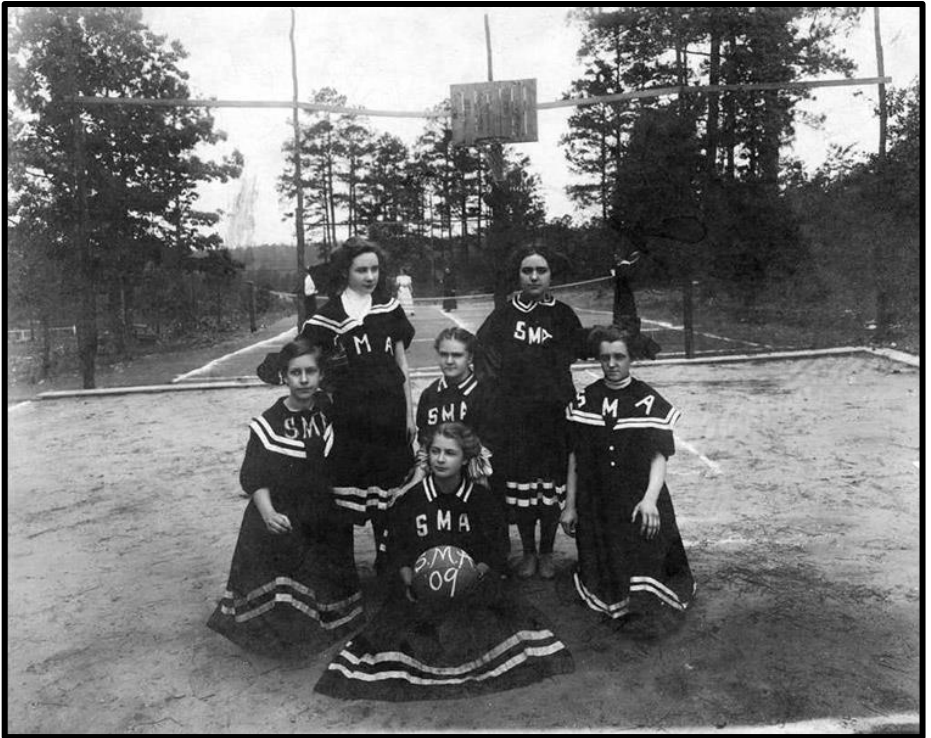
Mount St. Mary Academy basketball team, 1909.

The registration fee is $10. Deadline for registration is March 31 .