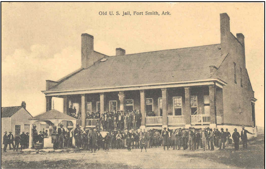
Old U.S. Jail, Fort Smith before 1886

Registration: Members can complete the registration form and send with check or money order to the Arkansas Historical Association, Department of History, 416 N. Campus Drive, Main 416, University of Arkansas, Fayetteville, AR 72701 or register online at www.arkansashistoricalassociation.org . The registration fee is $25. The deadline for registration with meals is April 3 .