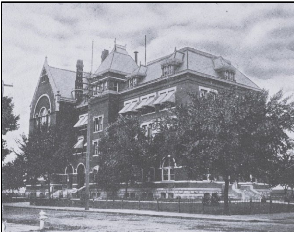
United States Courthouse and Post Office, Fort Smith, ca. 1910

Arkansas Women's History Institute Susie Pryor Award