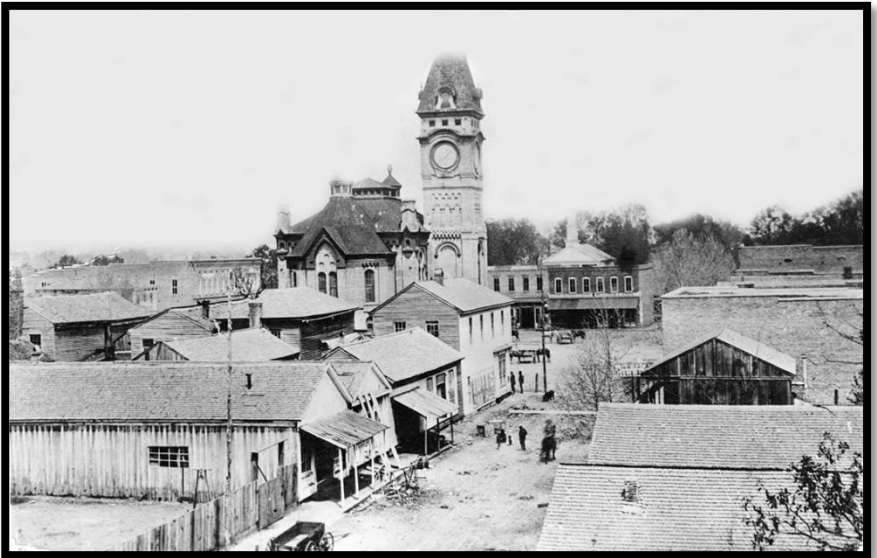
Monticello, Arkansas, 1879.

Registration: Members may complete the form received in the mail and send it with check or money order to the Arkansas Historical Association, Department of History, 416 N. Campus Drive, Main 416, University of Arkansas, Fayetteville, AR 72701, or register online at arkansashistoricalassociation.org . The registration fee is $25. The deadline for registration with meals is March 31 .